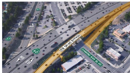
New eastbound SR-60 bypass bridge over Diamond Bar Boulevard to be used as a bypass for eastbound SR-60 commuters.