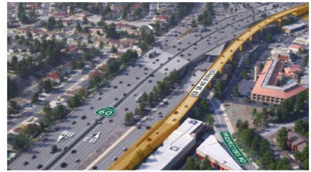
New eastbound SR-60 bypass bridge over Prospectors Road to be used as a new lane on eastbound SR-60.

split. To improve this congestion, the Confluence Chokepoint Relief Project will reduce lane weaving incidences by reconfiguring ramps and interchanges, and adding mainline bypass lanes, thus improving commuter safety and reducing traffic congestion. In addition, the Project will help alleviate supply chain challenges in the region. The impacts of this Project's construction in the City of Pomona are vehicles detouring off the eastbound SR-60 at Diamond Bar Blvd. and travelling through the City to get back onto the eastbound SR-60. City Staff are collaborating with Caltrans and San Gabriel Valley Council of Governments (SGVCOG) to modify those detour plans for a more efficient, less impactful route.