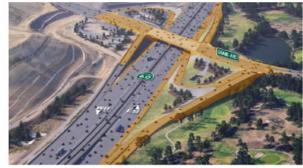
New Grand Avenue bridge with reconfigured on- and off-ramps.