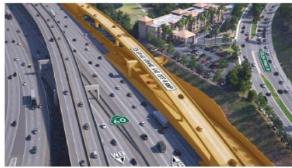
New eastbound SR-60 Grand Avenue bypass bridge exclusively for eastbound SR-60 commuters exiting Grand Avenue.

City of Diamond Bar and City of Industry