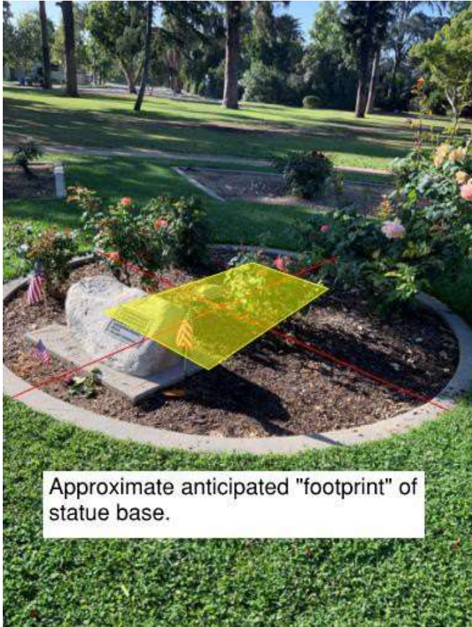
Approximate anticipated "footprint" of statue base.