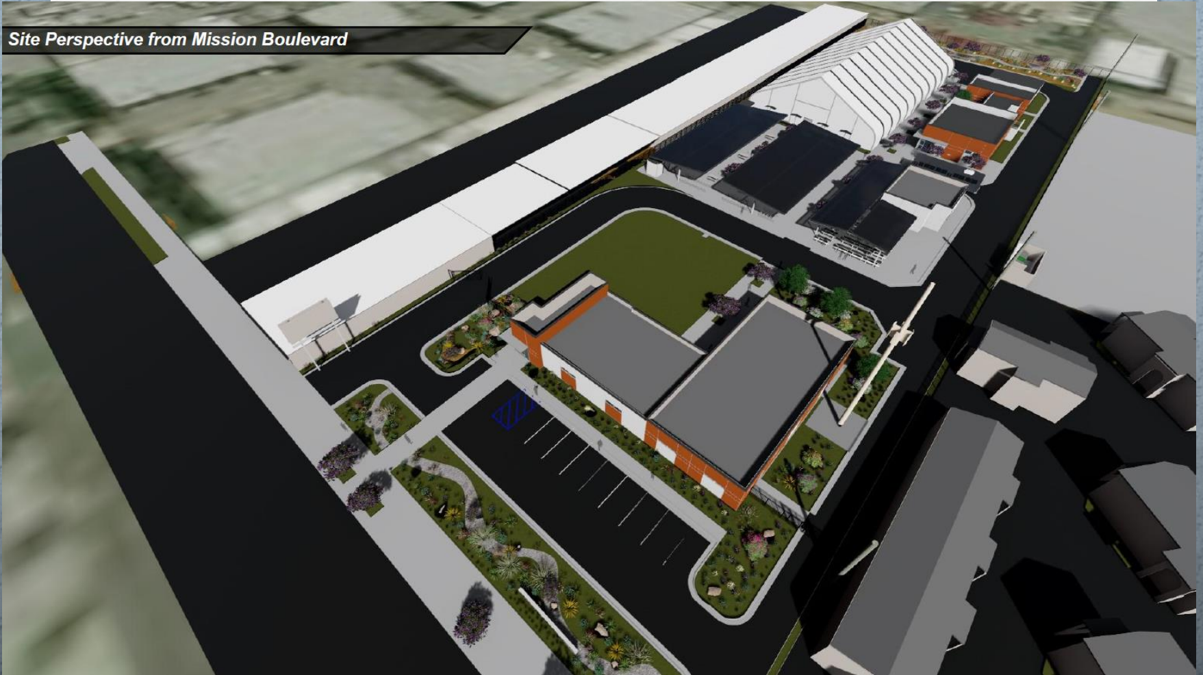
Site Perspective from Mission Boulevard