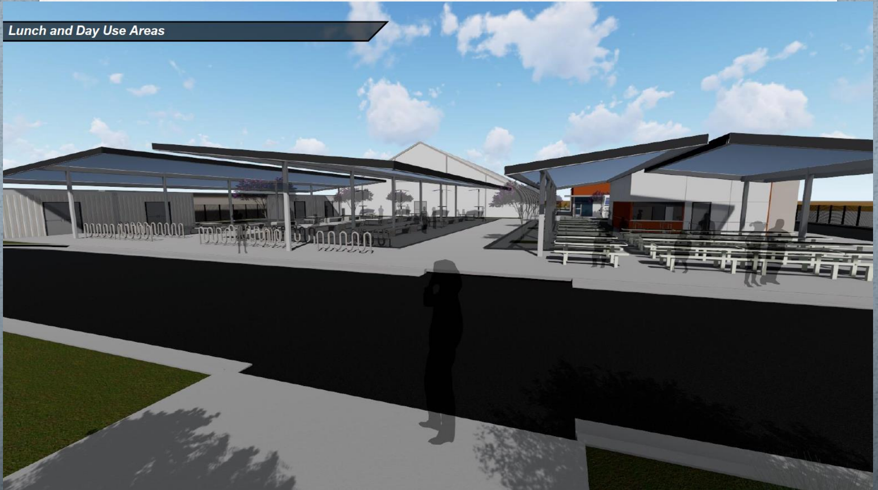
Lunch and Day Use Areas