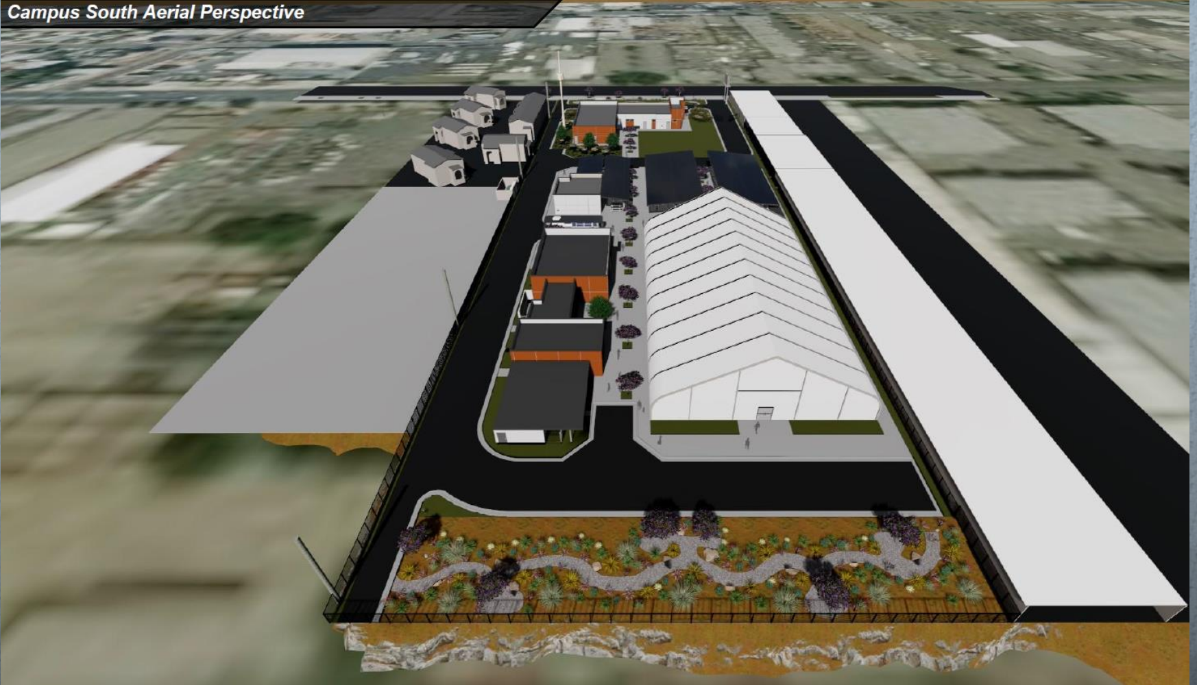
Campus South Aerial Perspective